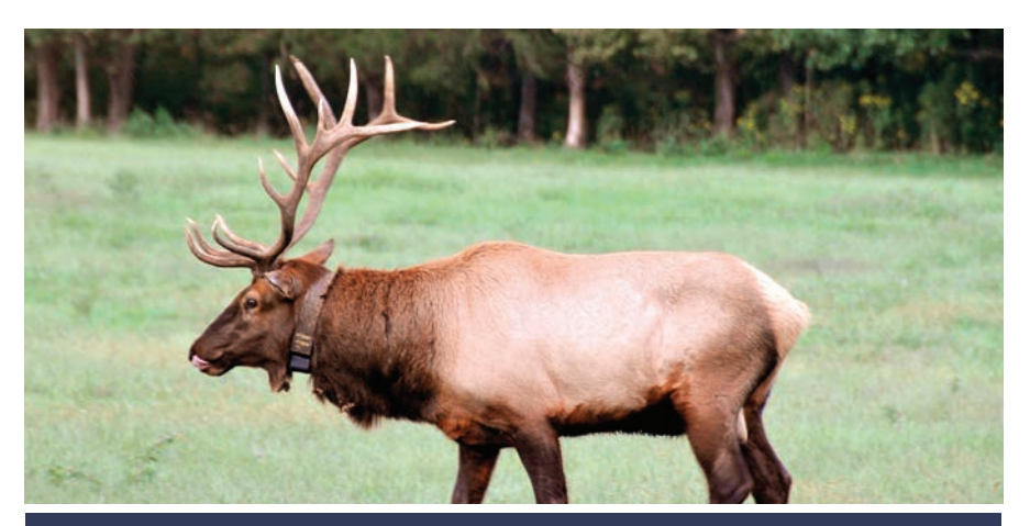
A bull elk in Boxley Valley wears a GPS collar used by Division wildlife researchers to study elk habitat patterns in the Buffalo River Valley.