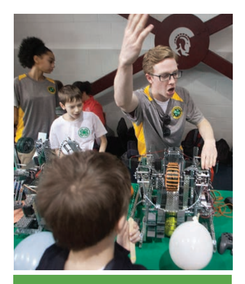
Through the Arkansas 4-H program, the Division of Agriculture puts a strong emphasis on learning by doing, with an increasing focus on science, technology, engineering and math.

Arkansas ranks 46th in the U.S. in number of citizens who live in poverty. Living in poverty has wide-reaching effects on individuals and families including increased risk of obesity, stressed relationships such as child abuse and maltreatment, lower educational attainment, and lack of access to healthcare and social support. Financial stress related to student loan and other debt interferes with Arkansans' ability to gain financial stability and security. The average Arkansas student loan debt of 2014 graduates is more than $25,000, and the average