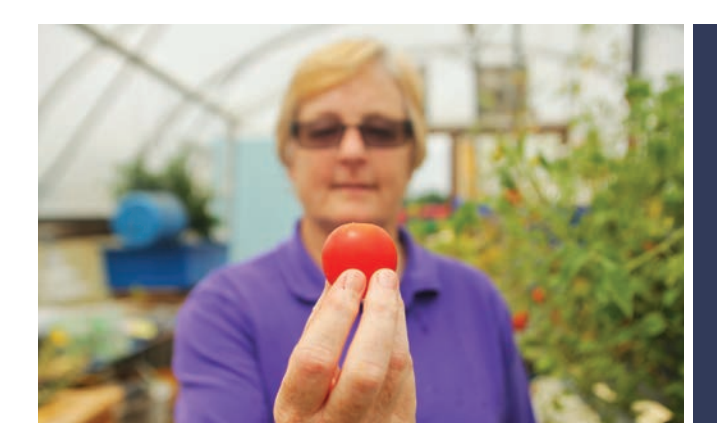
Division of Agriculture researchers are focused on helping producers find innovative ways of feeding the nation and the world.

The Division of Agriculture works to promote healthy diets through research and public education efforts, targeting obesity and encouraging better consumer habits. It seeks to enhance food safety through research and to teach best practices to commercial operators.