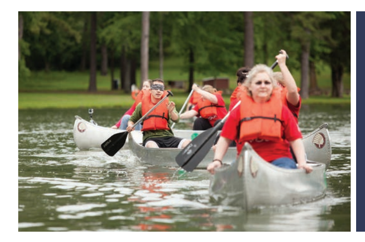
The Division of Agriculture provides team-building and outdoor exercise opportunities to Arkansans of all ages.

ty-eight percent of Arkansas's children live in poverty, and Arkansas had the highest rate of teen births in the U.S. in 2015. Division of Agriculture research and programs address these issues by offering education and tools to increase resilience and well-being among children and youth.