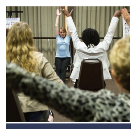
The Division of Agriculture strives to help Arkansans stay healthy throughout their entire lives, by providing avenues to nutrition, education and exercise.

"How to Talk to your Doctor," "Extension Wellness Ambassadors," "Keys to Embracing Aging," and "Estate Planning" are available to all senior adults, no matter what their health, relation-